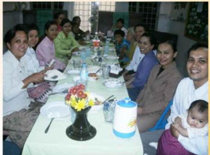
Fellowship after service in Phnom Penh