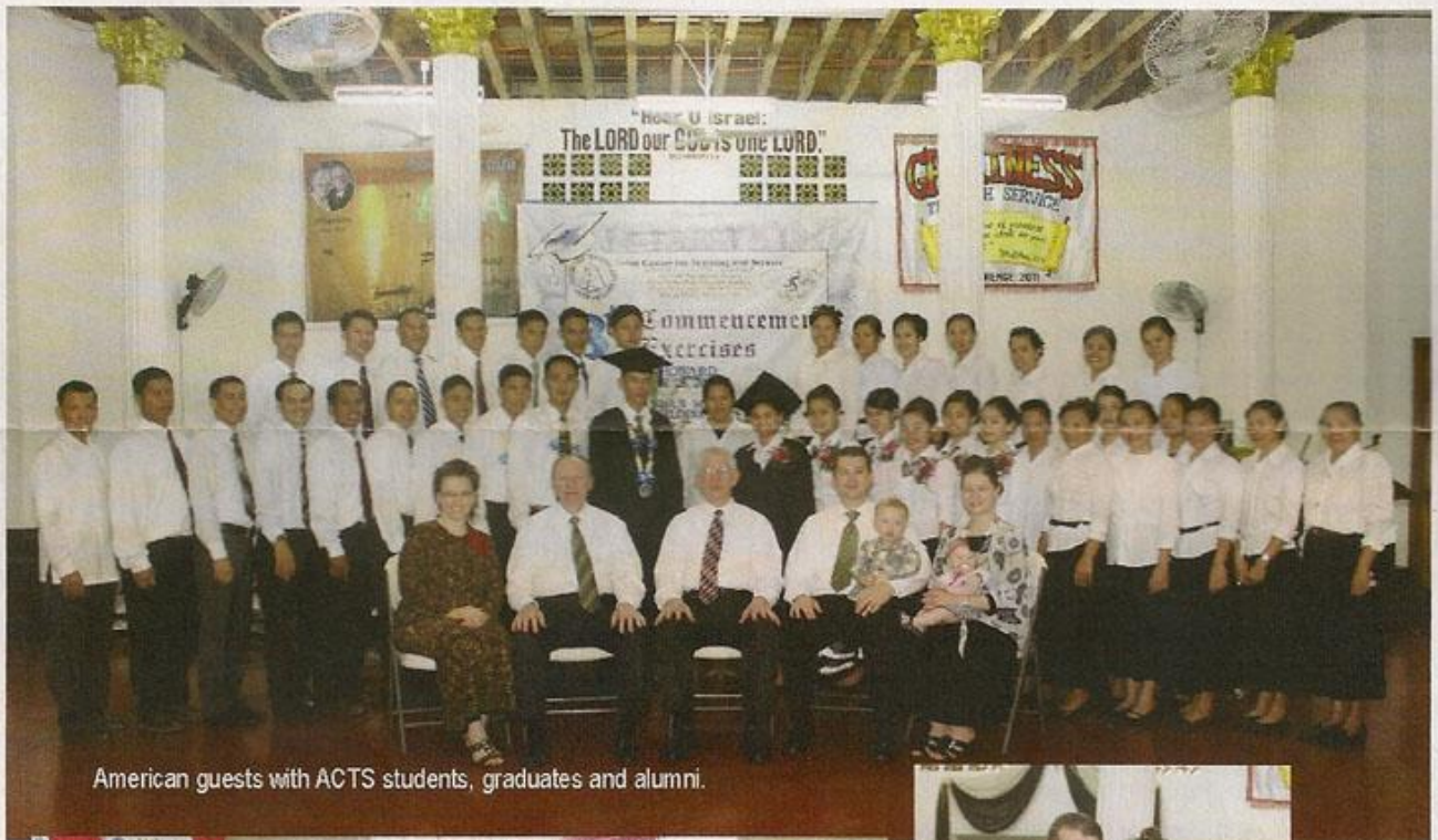
American guests with ACTS students, graduates and alumni.