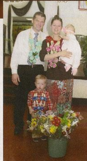
Welcome service for the Shorts in Bagong Silang